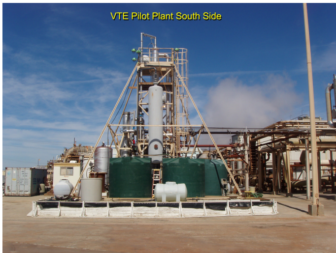
VTE Pilot Plant from south side in 2010, Figure 2.

Our tests simulate process conditions in several effects across the range of a multi-effect VTE Plant. The VTE distillation process applied to an MED plant design with low cost non-commercial geothermal steam or purchased low pressure steam as an energy source may prove cost competitive compared to other desalination technologies. A 15-effect plant could produce up to 14 pounds of distilled water for each pound of geothermal steam used. VTE technology could also have the advantage of discharging much lower volumes of concentrated brine than other methods. A recovery rate in excess of 80% from a seawater source is typical.