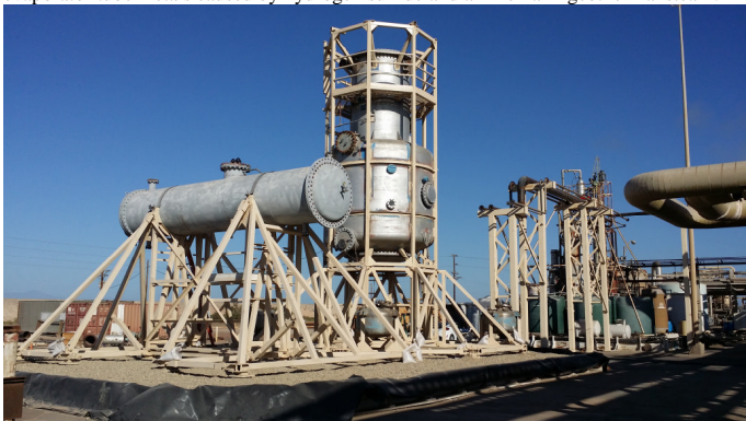
VTE Demonstration Plant under construction, Figure 5.

Testing is underway with the VTE Pilot Plant to control corrosion of copper alloy evaporator tube metals caused by hydrogen sulfide and ammonia in geothermal steam.